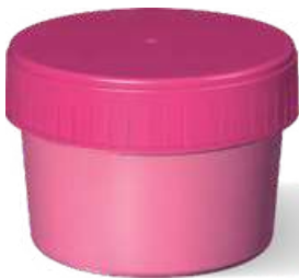
GAITA CONTAINER WITH CAP