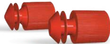
TUBE STOPPER FLANG TYPE